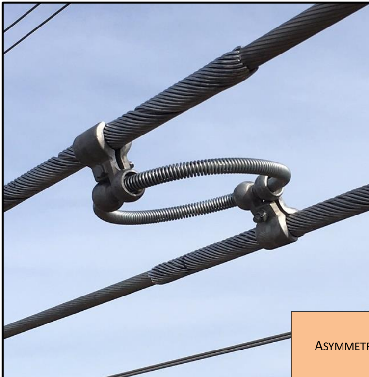
INSTALLED AR®SPACER DAMPER ASYMMETRIC CLAMPS ROTATE INDEPENDENTLY TO CONTROL GALLOPING WHILE MAINTAINING SEPARATION OF THE BUNDLES.