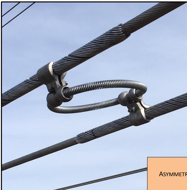
INSTALLED AR®SPACER DAMPER ASYMMETRIC CLAMPS ROTATE INDEPENDENTLY TO CONTROL GALLOPING WHILE MAINTAINING SEPARATION OF THE BUNDLES.