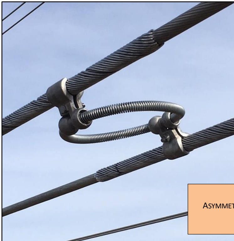
INSTALLED AR®SPACER DAMPER ASYMMETRIC CLAMPS ROTATE INDEPENDENTLY TO CONTROL GALLOPING WHILE MAINTAINING SEPARATION OF THE BUNDLES.