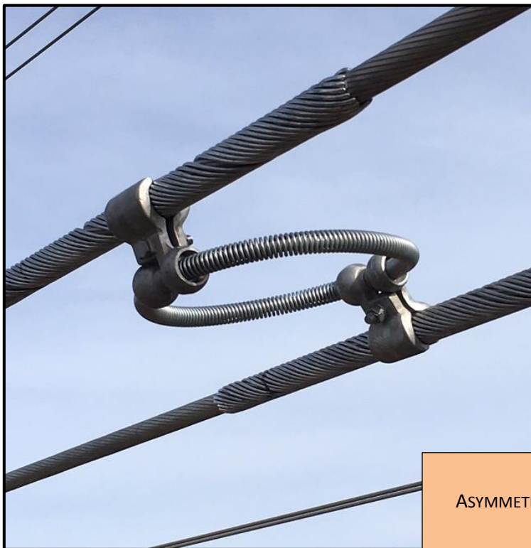
INSTALLED AR®SPACER DAMPER ASYMMETRIC CLAMPS ROTATE INDEPENDENTLY TO CONTROL GALLOPING WHILE MAINTAINING SEPARATION OF THE BUNDLES.